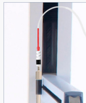
P/N 70-803-2849 installed on PerkinElmer S10