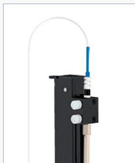
P/N 70-803-2754 installed on PerkinElmer S23