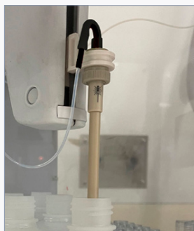
P/N 70-803-2008 installed on Agilent SPS 4